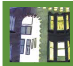
Quebec Manor, Side View (detail), Susan Gransby Linocut, 56cm x 38cm, 1987