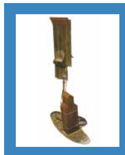
Evidence of Passage, Tiki Mulvihill Wood, snowshoe, leather, hardware, grain, 142cm x 78cm x 182cm, 2002