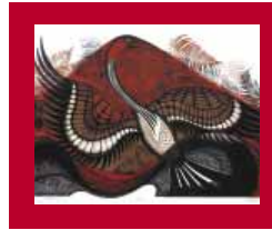
Loon (detail), Prina Granirer Lithograph, 37cm x 56cm, 1978